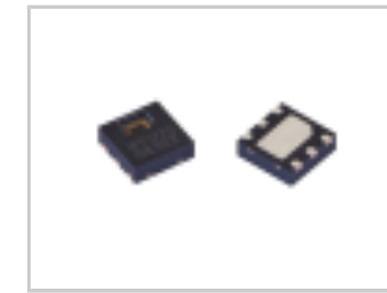
HTU20DF RH/T SENSOR W. FILTER