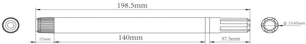
Dimension (Units: mm)